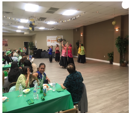
Ladies of the Church providing traditional Filipino dancing