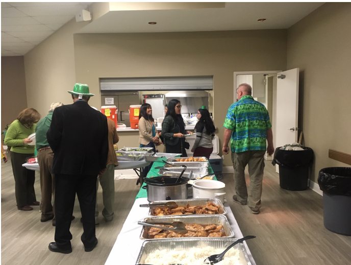
Can't beat the food, nor lack of it